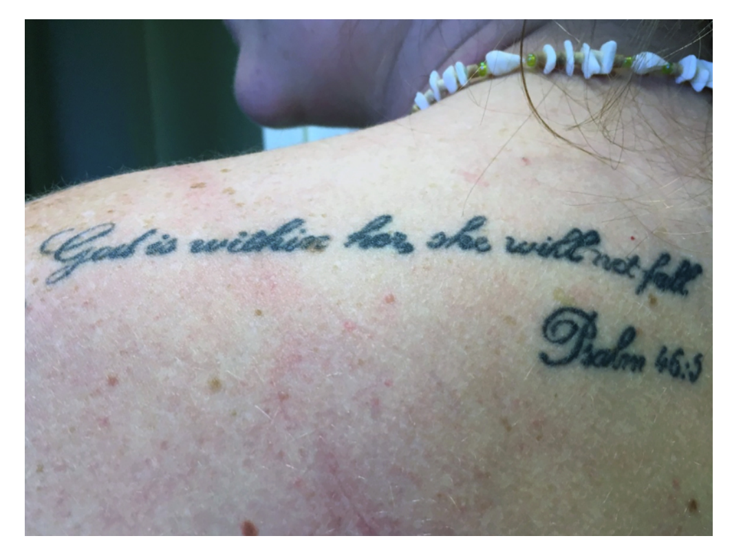
Figure 4. Bible verse tattoo on back of female college student 133 \times 100 mm (150 x 150 DPI)