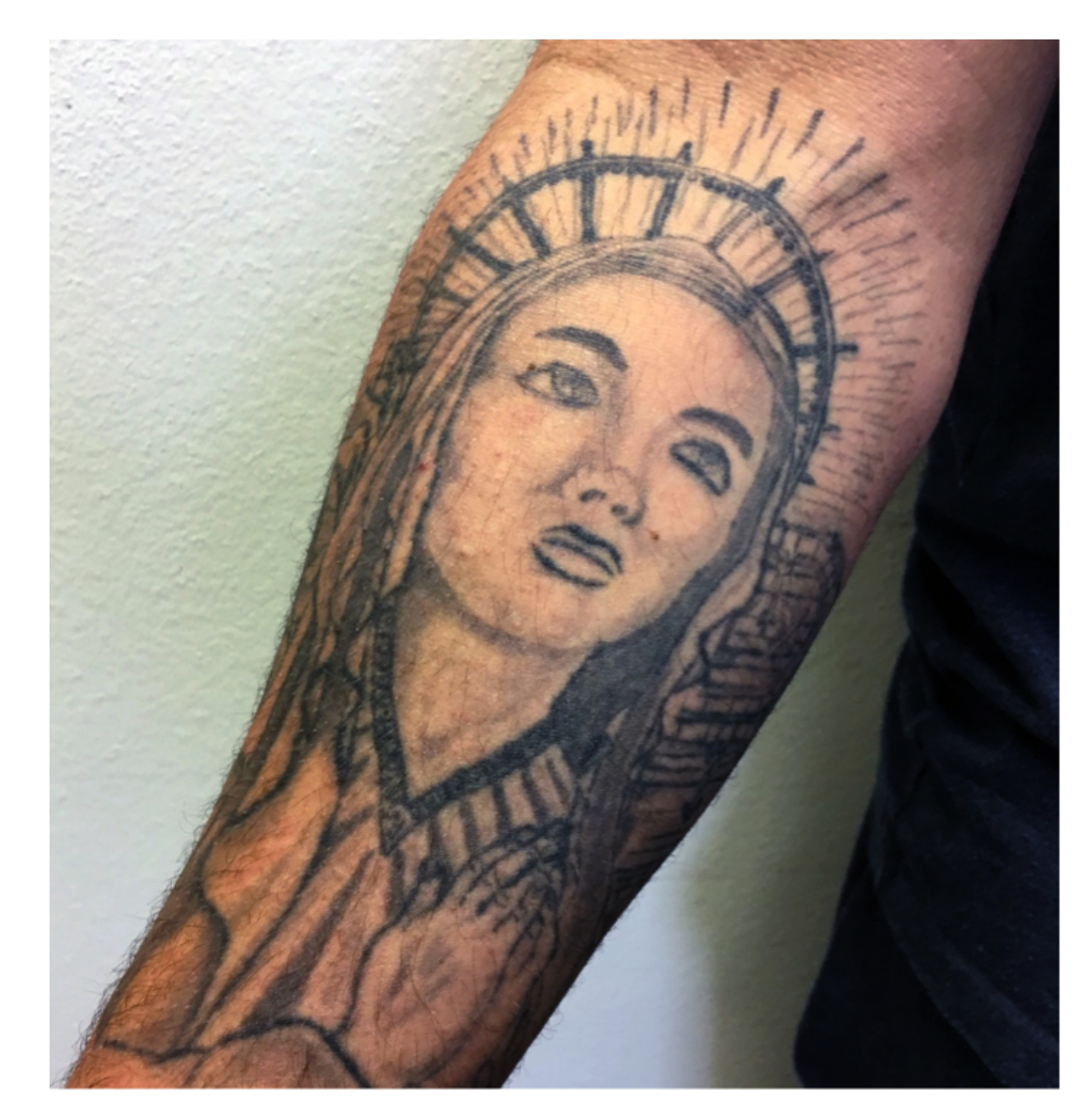
Figure 3. Virgin Mary tattoo on forearm of male college student