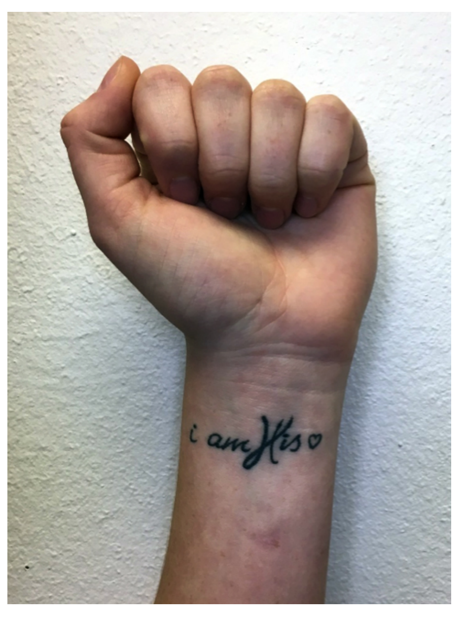
Figure 6. Inward facing religious tattoo on female college student 82 \times 109 \text{mm} (150 \times 150 \text{ DPI})