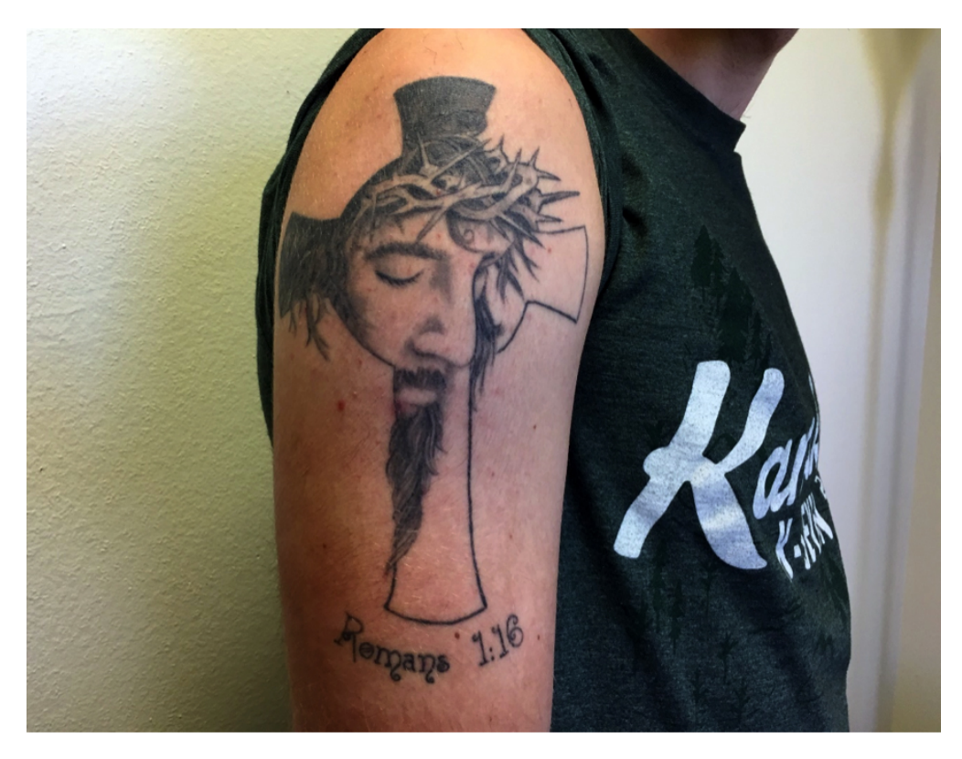
Figure 2. Large cross and scripture tattoo on arm of male college student 149 \times 114 mm (150 \times 150 DPI)