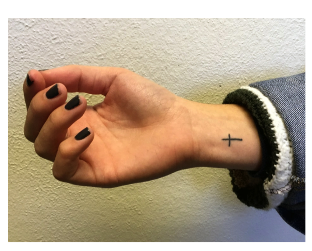
Figure 1. Small cross tattoo on wrist of female college student 108x81mm (150 x 150 DPI)